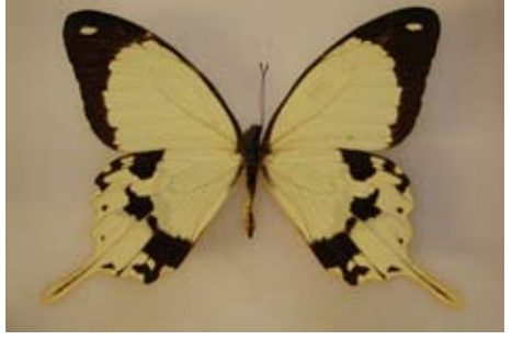
Mocker Swallowtail ( Papilio dardanus ) This is one of the commonest and interesting butterflies of Ghana. Its size and floppy flight has given it the popular name: flying handkerchief.