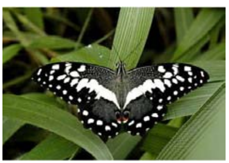
Citrus Swallowtail ( Papilio demodocus ). This butterfly can be found all over Africa. The caterpillar feeds on Citrus (Orange, Lemon) leaves.