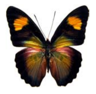
Marie-Christine's Striped Forester (Euphaedra mariaechristinae)