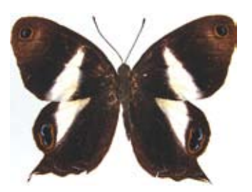
Dark banded Judy (Abisara intermedia)

This group of butterflies is often treated as a subfamily of the Lycaenidae. There are only a few of these butterflies in Africa and thus in Ghana. The few Punches and Judies in Ghana are hard to find.