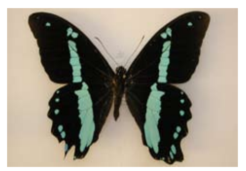
Narrow-Banded Green Swallowtail ( Papilio nireus ). There are two related species which differ by the width of the green band.