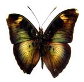
Ashanti Forester (Bebearia ashantina)

A huge family of medium to large-sized butterflies. They show enormous variation in sizes, shapes, and colors. Most of these species are attracted to fruit like Banana, Orange, Pawpaw and the likes. Many butterfly species known only from Ghana and Côte d'Iviore (endemics) come from this group. Such endemics include: