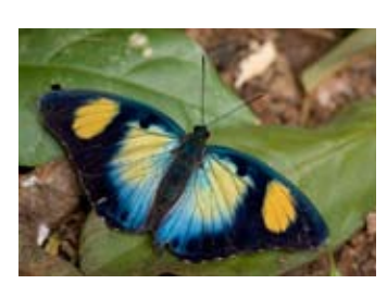
Splendid Themis Forester ( Euphaedra splendens ghanaensis )

Other butterflies of this group common in Ghana are: