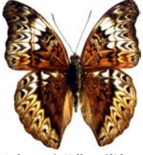
Auberger's Yellow Glider (Cymothoe aubergeri)

Other butterflies of this group common in Ghana are: